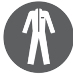
Wear protective clothing