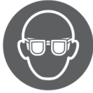
Wear eye protection