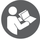
Refer to instructions

IMPORTANT: PLEASE READ THESE INSTRUCTIONS CAREFULLY. NOTE THE SAFE OPERATIONAL REQUIREMENTS, WARNINGS & CAUTIONS. USE THE PRODUCT CORRECTLY AND WITH CARE FOR THE PURPOSE FOR WHICH IT IS INTENDED. FAILURE TO DO SO MAY CAUSE DAMAGE AND/OR PERSONAL INJURY AND WILL INVALIDATE THE WARRANTY. KEEP THESE INSTRUCTIONS SAFE FOR FUTURE USE.