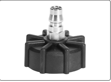
Straight Adaptor - Model No. VS820SA.

Parts support is available for this product. Please email sales@sealey.co.uk or telephone 01284 757500