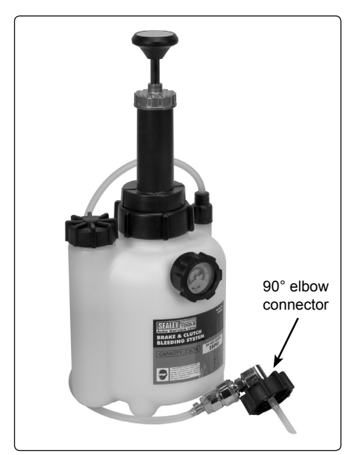
Brake and clutch bleeding system-Model No VS820.V4