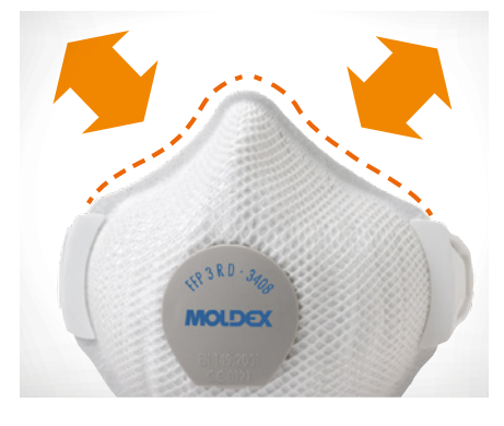
ActivForm<sup>®</sup> no nose clip needed