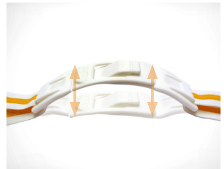
Flexible clip for more comfort