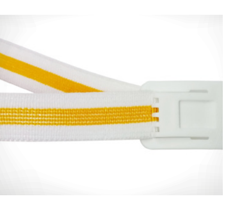
Extra wide size adjustable straps