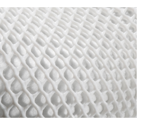
DuraMesh® structure keeps the mask in shape