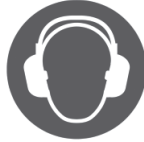
Wear ear protection