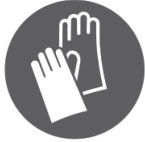
Wear protective gloves