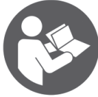
Refer to instructions

IMPORTANT: PLEASE READ THESE INSTRUCTIONS CAREFULLY. NOTE THE SAFE OPERATIONAL REQUIREMENTS, WARNINGS & CAUTIONS. USE THE PRODUCT CORRECTLY AND WITH CARE FOR THE PURPOSE FOR WHICH IT IS INTENDED. FAILURE TO DO SO MAY CAUSE DAMAGE AND/OR PERSONAL INJURY AND WILL INVALIDATE THE WARRANTY. KEEP THESE INSTRUCTIONS SAFE FOR FUTURE USE.