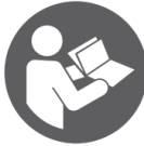
Refer to instruction manual

IMPORTANT: PLEASE READ THESE INSTRUCTIONS CAREFULLY. NOTE THE SAFE OPERATIONAL REQUIREMENTS, WARNINGS & CAUTIONS. USE THE PRODUCT CORRECTLY AND WITH CARE FOR THE PURPOSE FOR WHICH IT IS INTENDED. FAILURE TO DO SO MAY CAUSE DAMAGE AND/OR PERSONAL INJURY AND WILL INVALIDATE THE WARRANTY. KEEP THESE INSTRUCTIONS SAFE FOR FUTURE USE.