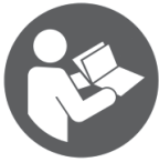
Refer to instructions

IMPORTANT: PLEASE READ THESE INSTRUCTIONS CAREFULLY. NOTE THE SAFE OPERATIONAL REQUIREMENTS, WARNINGS & CAUTIONS. USE THE PRODUCT CORRECTLY AND WITH CARE FOR THE PURPOSE FOR WHICH IT IS INTENDED. FAILURE TO DO SO MAY CAUSE DAMAGE AND/OR PERSONAL INJURY AND WILL INVALIDATE THE WARRANTY. KEEP THESE INSTRUCTIONS SAFE FOR FUTURE USE.