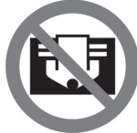
Do not cover