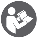
Refer to instructions

IMPORTANT: PLEASE READ THESE INSTRUCTIONS CAREFULLY. NOTE THE SAFE OPERATIONAL REQUIREMENTS, WARNINGS & CAUTIONS. USE THE PRODUCT CORRECTLY AND WITH CARE FOR THE PURPOSE FOR WHICH IT IS INTENDED. FAILURE TO DO SO MAY CAUSE DAMAGE AND/OR PERSONAL INJURY AND WILL INVALIDATE THE WARRANTY. KEEP THESE INSTRUCTIONS SAFE FOR FUTURE USE.