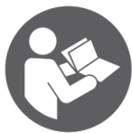
Refer to instructions

IMPORTANT: PLEASE READ THESE INSTRUCTIONS CAREFULLY. NOTE THE SAFE OPERATIONAL REQUIREMENTS, WARNINGS & CAUTIONS. USE THE PRODUCT CORRECTLY AND WITH CARE FOR THE PURPOSE FOR WHICH IT IS INTENDED. FAILURE TO DO SO MAY CAUSE DAMAGE AND/OR PERSONAL INJURY AND WILL INVALIDATE THE WARRANTY. KEEP THESE INSTRUCTIONS SAFE FOR FUTURE USE.