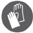
Wear protective gloves