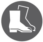
Wear protective footwear