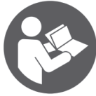
Refer to instruction manual

IMPORTANT: PLEASE READ THESE INSTRUCTIONS CAREFULLY. NOTE THE SAFE OPERATIONAL REQUIREMENTS, WARNINGS & CAUTIONS. USE THE PRODUCT CORRECTLY AND WITH CARE FOR THE PURPOSE FOR WHICH IT IS INTENDED. FAILURE TO DO SO MAY CAUSE DAMAGE AND/OR PERSONAL INJURY AND WILL INVALIDATE THE WARRANTY. KEEP THESE INSTRUCTIONS SAFE FOR FUTURE USE.